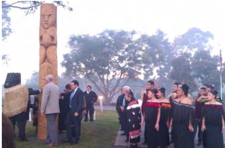
Inspecting the Pou with Whitireia Community Polytechnic performers looking on.