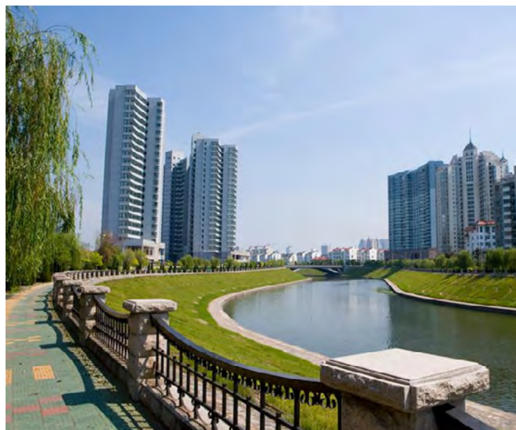
Hefei City Moat

On a personal level, my hosts were very hospitable, and demonstrated a passion for New Zealand and a deep desire to learn more about our country. It was an extremely exciting conversation that took place and I encourage our members to get in touch with me if you are interested in exploring a partnership with Hefei.